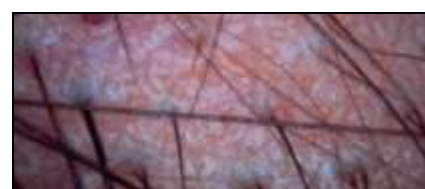
Fig 2: Vellus hair and variation in diameter of hair follicles

The above data suggests that variation in Hair Diameter (Fronto-Temporal Area) is specifically found in AGA in this study.