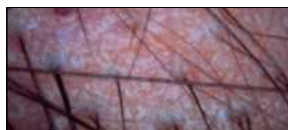
Fig 2: Vellus hair and variation in diameter of hair follicles

The above data suggests that variation in Hair Diameter (Fronto-Temporal Area) is specifically found in AGA in this study.