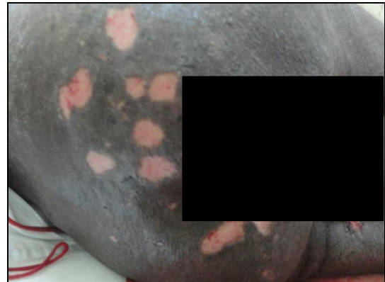
Fig 2: Herpes genitalis in a HIV positive patient with extensive ulceration