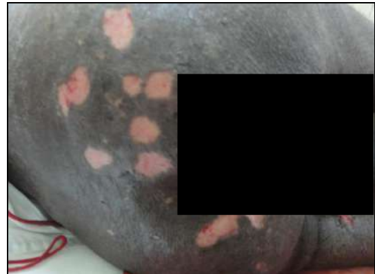
Fig 2: Herpes genitalis in a HIV positive patient with extensive ulceration