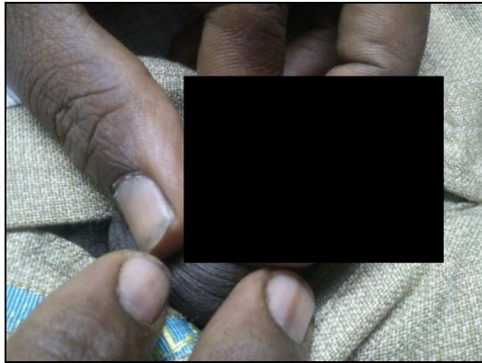
Fig 1: Herpes genitalis – Superficial ulcers over inner aspect of prepuce