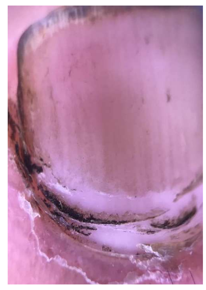
Fig 8: Dermatoscopy (polarised 10X mode) showing hyperkeratotic cuticle on an erythematous background, haemorrhagic spots in nail fold in dermatomyositis