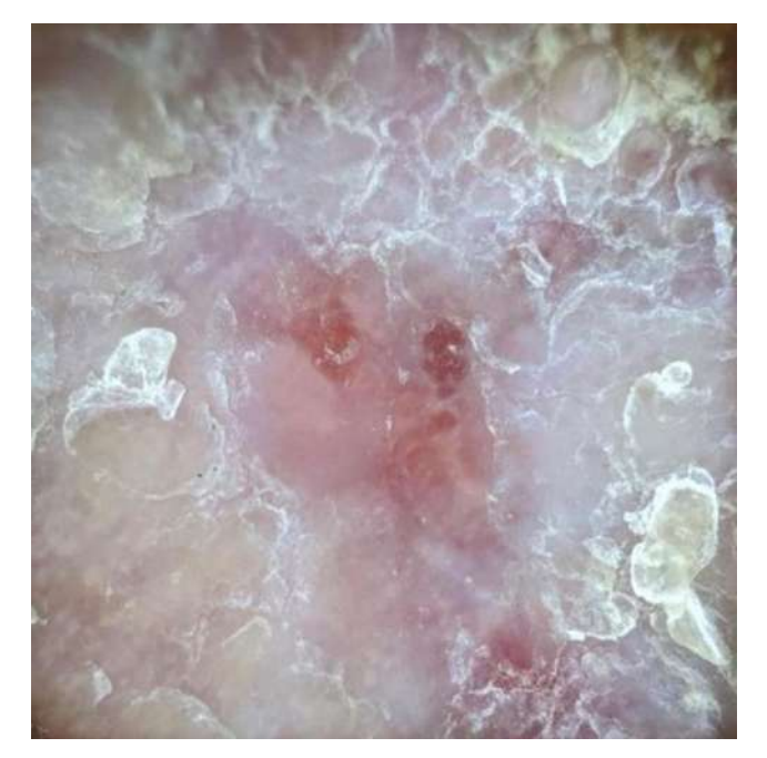
Fig 9: Dermatoscopy (polarised 10X mode): violaceous spots on a reddish background, central white and orange areas seen in erythema elevatum diutinum