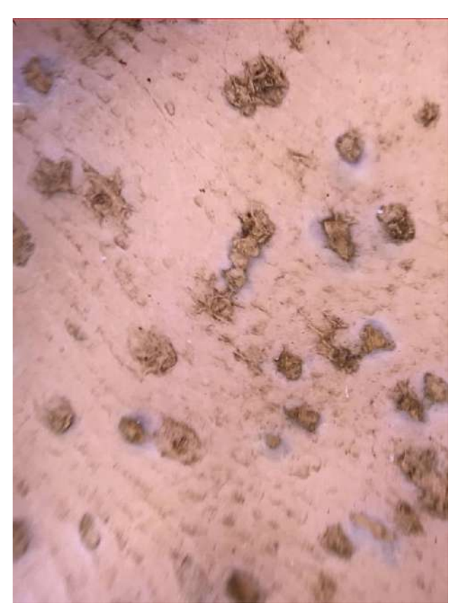
Fig 7: Dermatoscopy (polarised 10X mode) of pitted keratolysis shows multiple yellowish brown crateriform pits with peripheral white collarette with free inner margin

Fig 6: Dermatoscopy polarised 10X mode shows multiple yellow dots with diffuse scaling seen with wickham's striae.