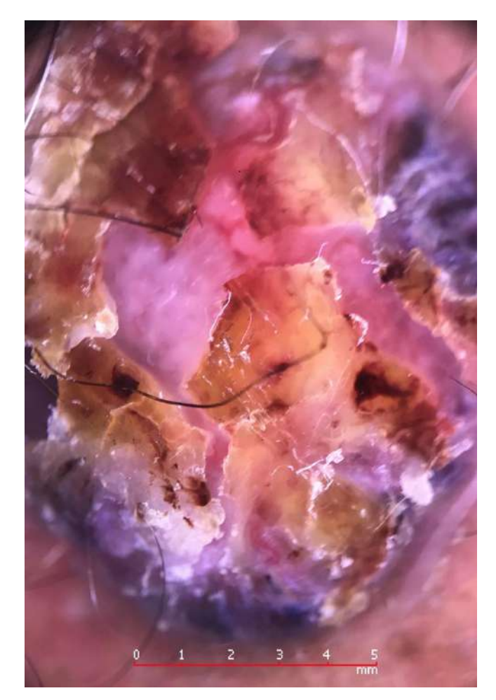
Fig 2: Dermatoscopy 10X polarized mode showing dilated capillaries with yellowish white serocrusts