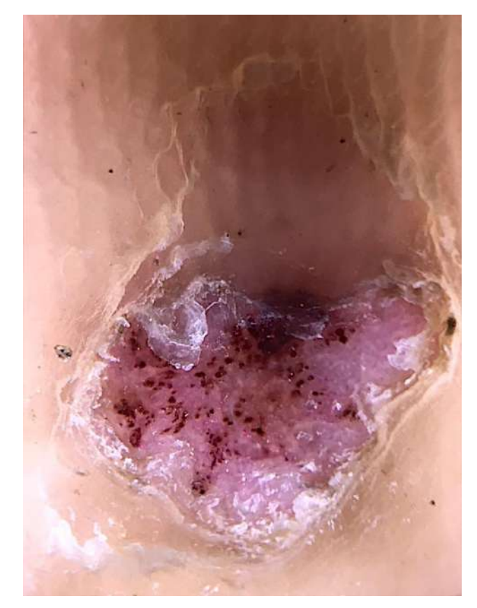
Fig 10: Dermoscopy (polarised mode 10 X) shows white line in periphery and double white track line in some areas with red dots, globules and few homogenous white areas